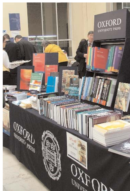
The Oxford University Press stand in the Book Exhibition at the Granada Joint Sessions.