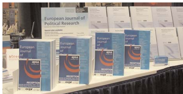
Copies of the EJPR on the ECPR book stand at the APSA Annual Meeting in Washington; a reception co-hosted with the publishers Blackwell also takes place each year at APSA.